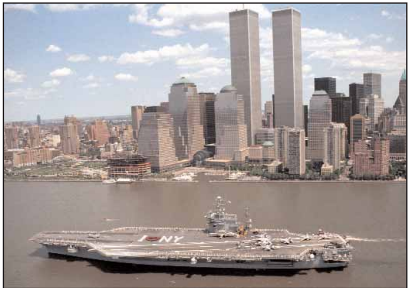
Carriers are generally designed for all-out attacks on nation states. The direct utility of aircraft carriers in the War on Terror is questionable

This report focuses on the economic aspects of Trident replacement and the carrier programme, and in particular the opportunity costs - what else could be done with the money, either in the economy more generally or in addressing a broader concept of the UK's security - as well as the headline cost figures. The next section considers the evolution of the UK's defence policy, which led to these two procurement decisions, followed in section 3 by an estimate of the cost of Trident replacement and the carriers, using official and publicly available information. This also includes computations of the net present value of the projects.