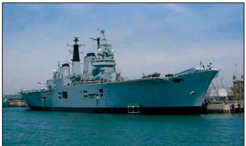
HMS Invincible, one of Britain's current fleet of three much smaller aircraft carriers to the the new CVF.

Programmes such as the Future Rapid Effects System (FRES), a family of medium-weight land vehicles, are also designed to increase the capability for rapid interventions. On the other hand, the capability to defend against a major conventional threat to the UK or its allies is no longer considered necessary. There will accordingly be less requirement for main battle tanks and heavy artillery, in favour of more medium and light-weight forces, and some naval vessels will be retired. There will be increased investment in C4ISR systems 21 for network-enabled capability warfare, and on 'key enablers' such as logistics which tend to be required in all expeditionary operations, and which are particularly overstretched at present.