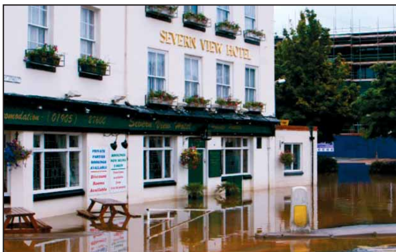
Flooded pub 'overlooking' the River Severn

£800m annual spend would represent a modest but worthwhile sum for fiscal and capital support measures for renewable energy, energy conservation and fuel efficiency, which would allow a significant effort towards tackling the UK's carbon emissions and oil dependence.