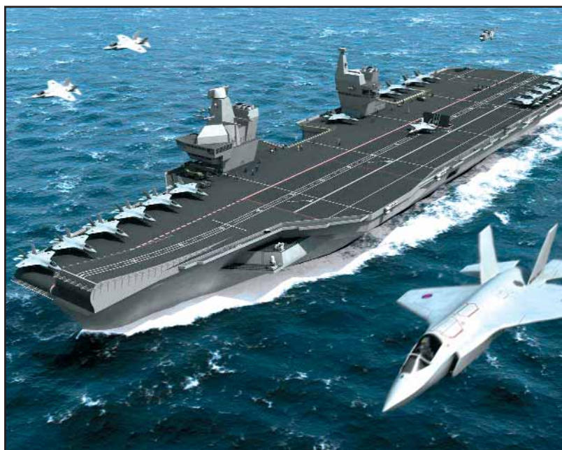
A computer model of the planned aircraft carriers

Alternatively, a rule of thumb based on past experience with similar generational replacements would suggest that new weapons systems tend to cost around twice as much as their predecessors. 33 For example, the acquisition cost to the United States of the Poseidon C-3 missile system (in service 1971) was $13.9bn in 1996 prices, while the cost of the Trident II D-5 (in service in 1990) was $30bn - just over a doubling of cost over 20 years. 34 The US Virginia class nuclear attack submarine (first boat ordered in 1998) cost $2.1bn, an increase in real unit cost over the preceding Los-Angeles class by a factor of around 1.9, over a period of 27 years. 35 Double the Vanguard-class would give a cost of £26bn in 2006 prices, including the cost of an eventual replacement for the warheads, but not including the missiles.