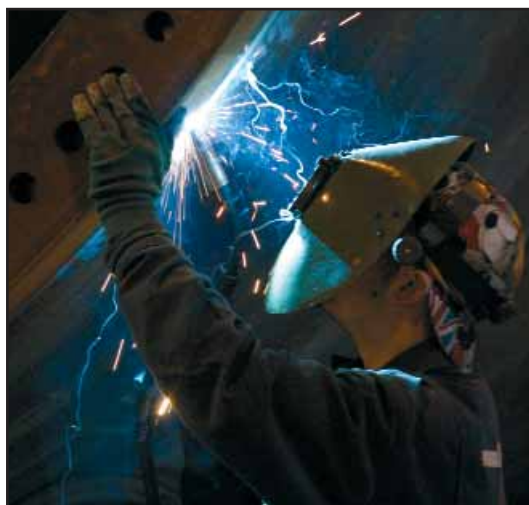
Vesta's wind-turbine factory in Campbeltown, Scotland, is a good example of responsible investment helping local and international efforts for a peaceful and sustainable future. September 2004

Our estimates of the cost of the two programmes suggest a total net present value of £57bn, which implies an equivalent annual cost of around £5bn per annum. Cutting the two programmes and reducing the defence budget need not create economic problems; localised issues could be dealt with by regional assistance. If the expenditures were to be reallocated to other forms of government spending then the cuts in the budget are likely to lead to improved economic performance.