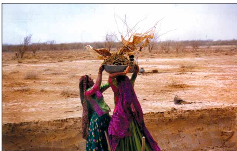
Women collect firewood in a drought-stricken region of India.