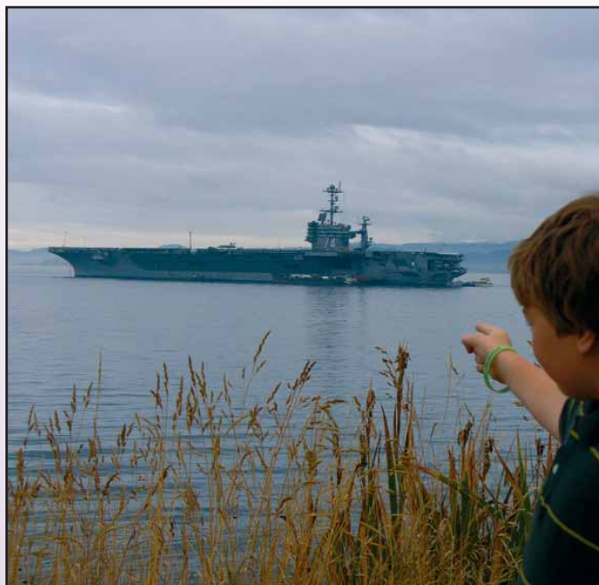
A child points at the USS John C. Stennis aircraft carrier

10. If the two programmes were to be cancelled the study concludes that savings of over £3.9bn for every year of service life would be made for the Trident replacement and around £1.1bn for the carriers and accompanying aircraft.