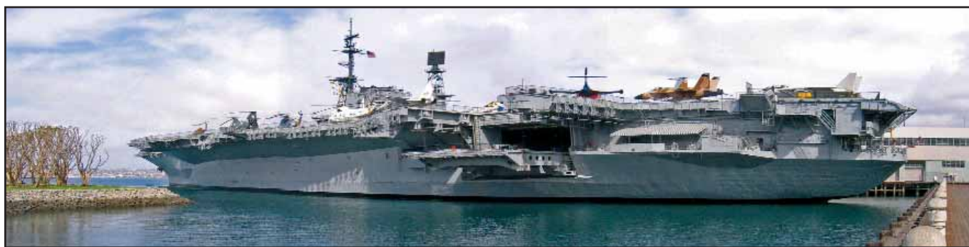
USS Midway Aircraft Carrier, now a museum in San Diego, USA.

Clearly, the process of the SDR, the New Chapter and the 2003 Defence White Paper represent a comprehensive reconsideration of UK security policy. But not only have all of the cold war weapon systems in production and even pre production survived (albeit with reduced numbers in some cases), but now a massive rearmament programme is being planned. The UK failed to consider the possibility of non offensive defence or the transformation of NATO, an organisation developed for the Cold War and still largely wedded to an outdated 1999 Strategic Concept. 22 This review process also left untouched a continuing commitment to nuclear weapons and so to a Trident replacement, which when combined with the aircraft carrier programme and other offensive weapons acquisitions, represents an unquestioning emphasis on power-projection capability, including long-range offensive air capability. 23