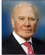
Des Browne, Malcolm Rifkind and Menzies Campbell

The other members of the Commission are: